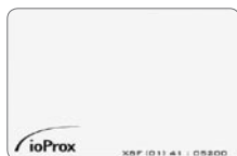
P20DYE Dye-Sub Card