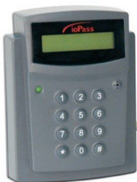
SA-600-EN *Reader and cards are not shown to scale.

SA-500-EN . . . . . Stand-alone controller with integrated proximity reader SA-600-EN . . . . . Stand-alone controller with external proximity reader SA-RM56 . . . . . Additional relay module P10SHL . . . . . Standard ioProx proximity card P20DYE . . . . . Thin ioProx proximity card, front/back surface glossy for Dye-Sub printing P30DMG . . . . . Dye-Sub card with mag stripe P40KEY . . . . . ioProx proximity keytag P50TAG . . . . . ioProx self-adhesive tag