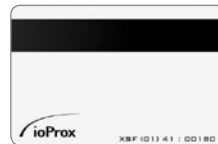
P30DMG Dye-Sub Card with Mag Stripe